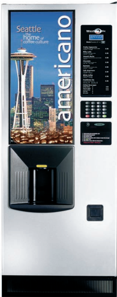
Kicker plate standard

Thanks to our innovative EASI-FIT machine graphics we can produce designs that perfectly compliment your own business needs and are unique to you!