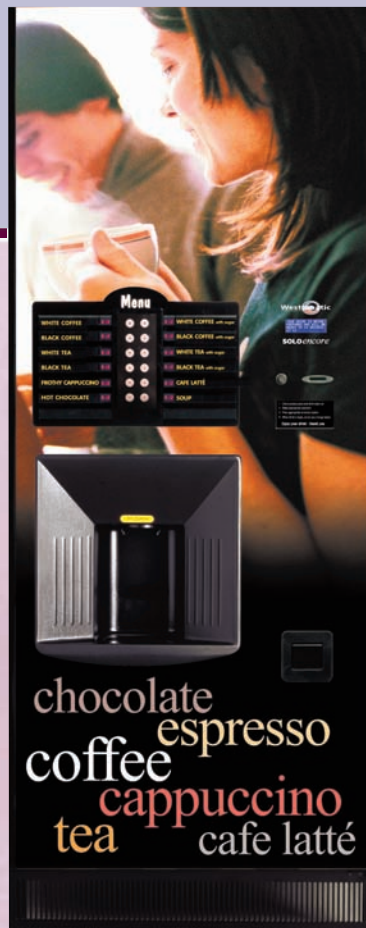
Kicker plate optional